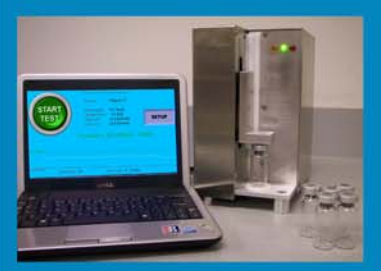
Non destructive and objective crimp seal tester