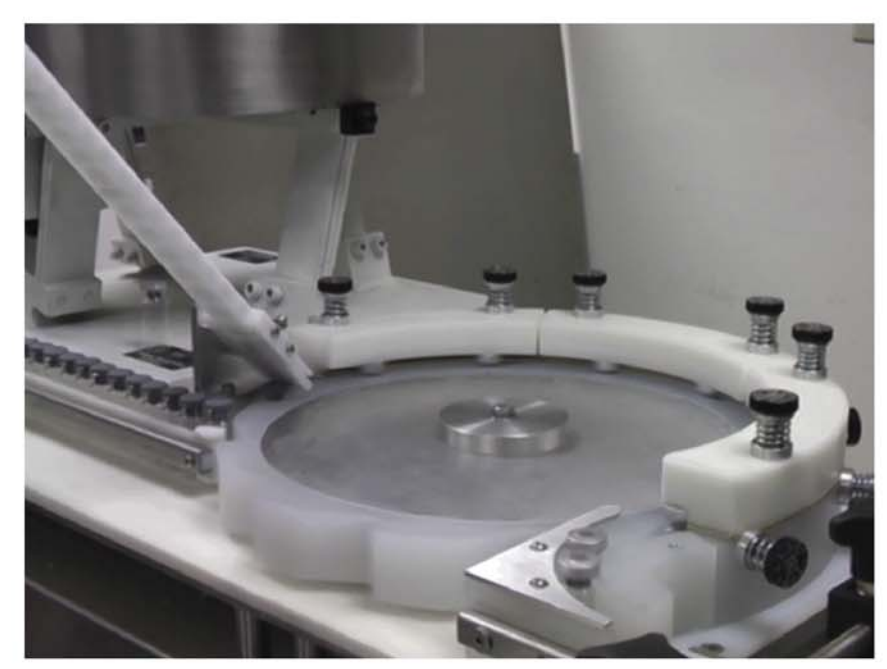
AMT™ Fully Automatic Crimp Sealing